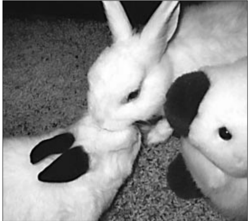
Above: He doesn't mind being showered with all the affection.