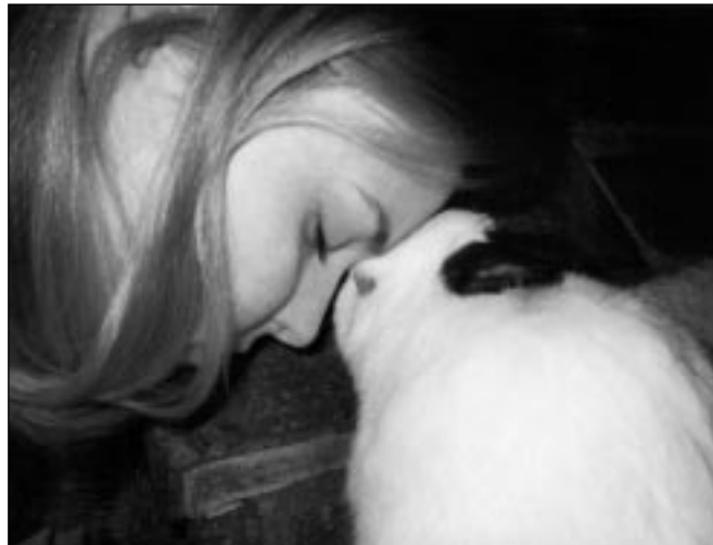
I didn't realize how much I would love him.

Sweetpea came to me from my sister who kept him in a cage downstairs. Like so many others she didn't understand or know the wonderful creature she had captive in her basement. I asked her if I could have him since the kids were no longer interested in spending much time with him and she agreed. My husband had a house rabbit before we ever met and he was always telling me these wonderful stories. I was excited at the