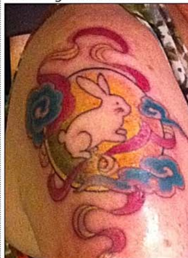
Rabbit in the moon.