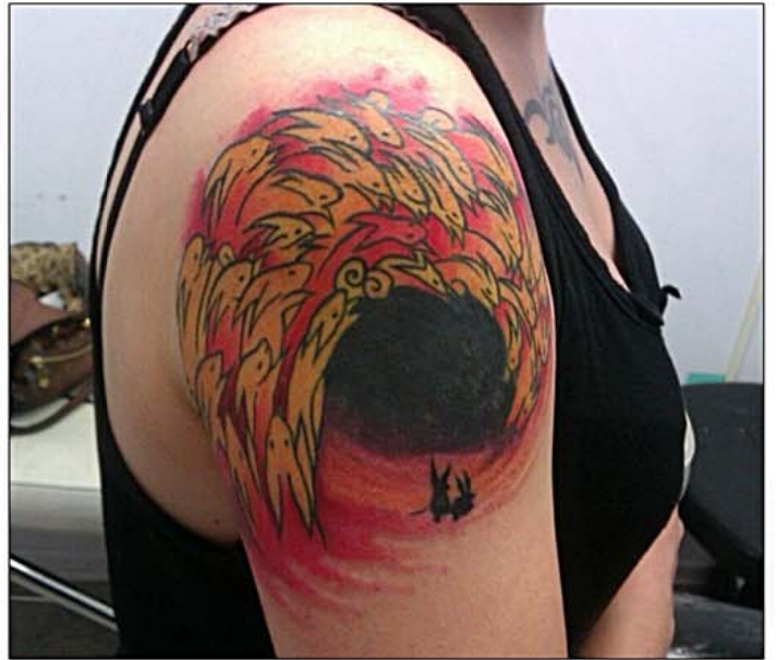
The rainbow rabbit tattoo stands for all the bunnies who will come into Gretta's life through her rescue.

need – http://bundergroundrailroad.org/blog/